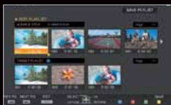
Playlist Edit on-screen display

It is possible to apply Playlist and Cut Edits to titles stored on the internal hard drive, so you can create edited videos that meet your specific needs. You can also create Auto Repeat discs that automatically resume playback from the start for unattended demonstrations.