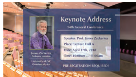
Displays stored image files in near screen-wide size. Useful for showing announcements or various information at a certain interval.

*Time is approximate. It does not necessarily guarantee that switching the slide precisely at set seconds.