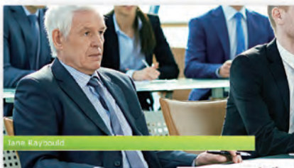
Preset Position Overlay